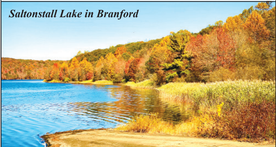
Saltonstall Lake in Branford