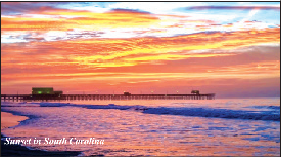
Sunset in South Carolina