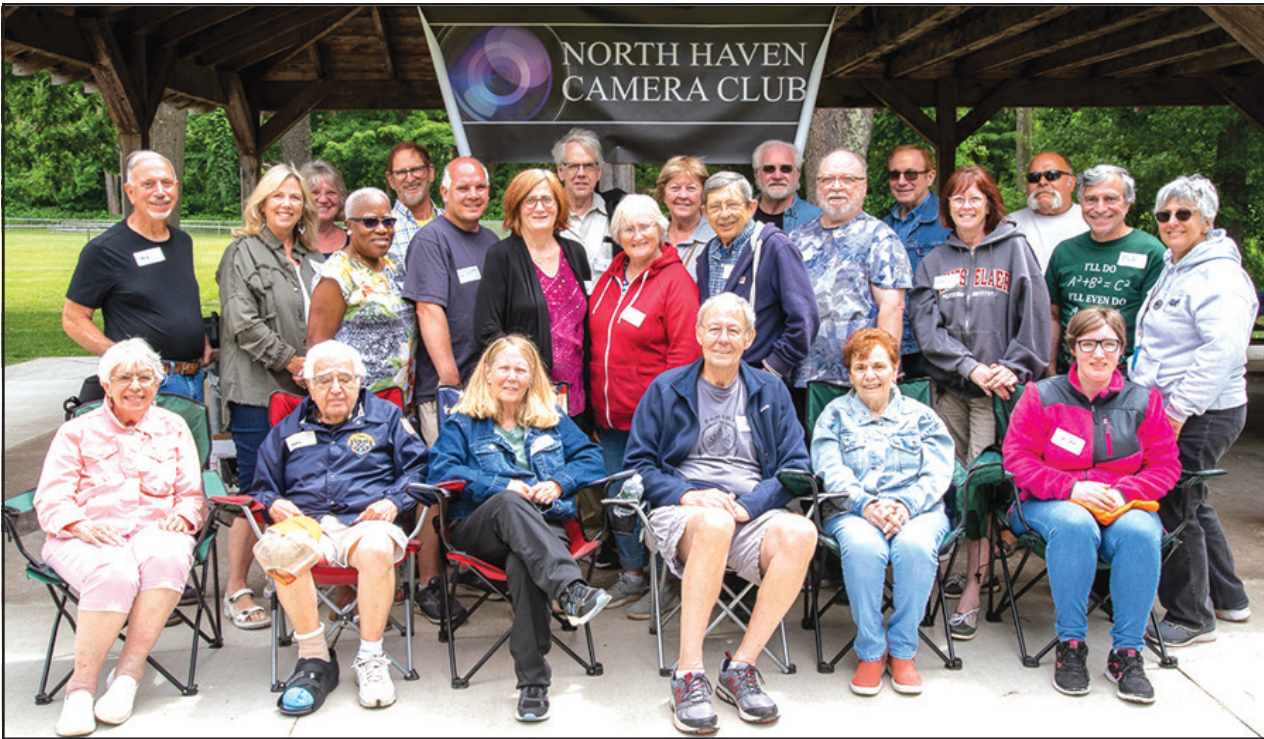
Members of the North Haven Camera Club take time for a group photo at their end of season outing which also celebrated their ten year anniversary