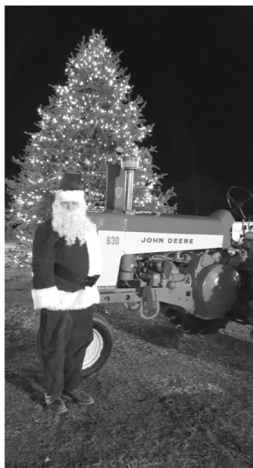
Cosponsored by the North Branford Rotary