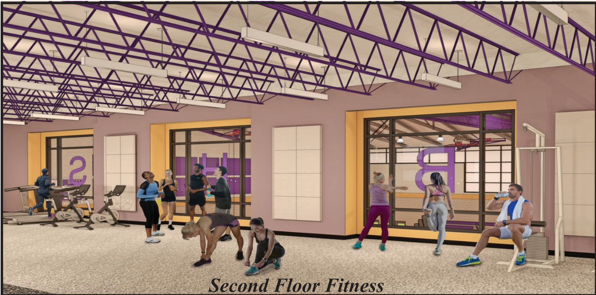
Second Floor Fitness