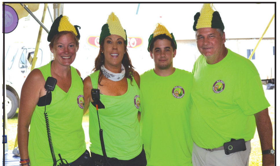
Poco