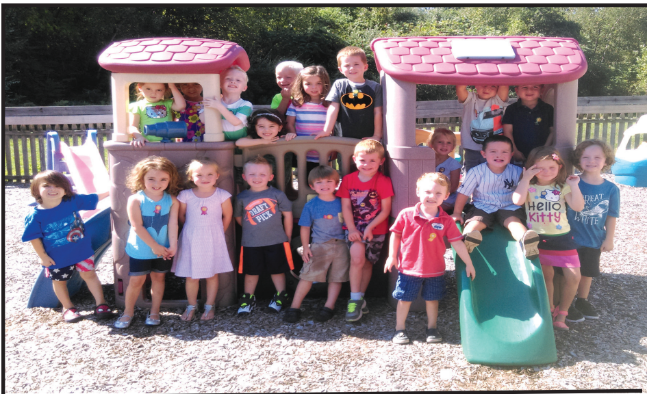
Northford Preschool Academy children are excited to be in school!