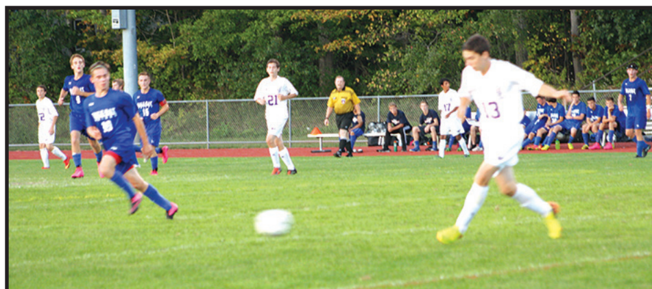
Boys soccer team has started the season at 0-3.