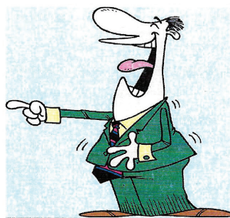
MC — TBA

Current Warm-up Comic for Emmy winning TV show