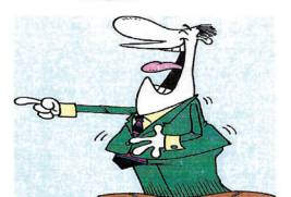
MC — TBA

Current Warm-up Comic for Emmy winning TV show