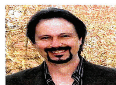
Dom Fig—Opening Act

Last Comic Standing, Comedy Central, VH1 and A&E