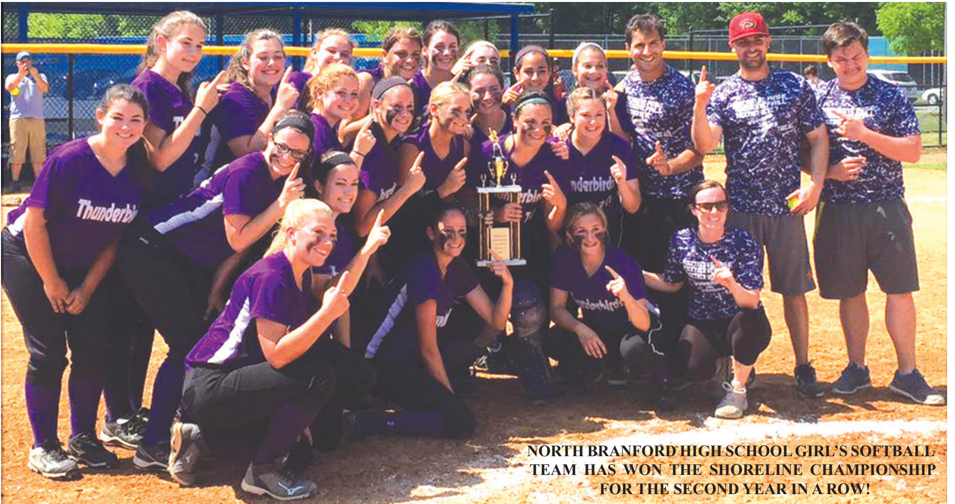
NORTH BRANFORD HIGH SCHOOL GIRL'S SOFTBALL TEAM HAS WON THE SHORELINE CHAMPIONSHIP FOR THE SECOND YEAR IN A ROW!