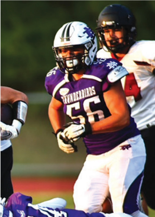
Langelo leading the defensive charge