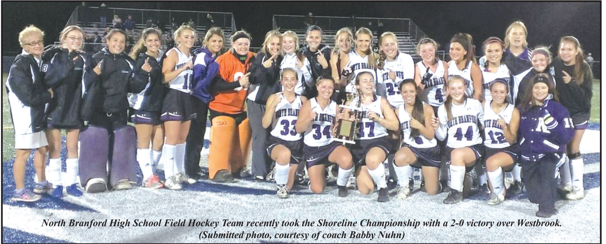
North Branford High School Field Hockey Team recently took the Shoreline Championship with a 2-0 victory over Westbrook.