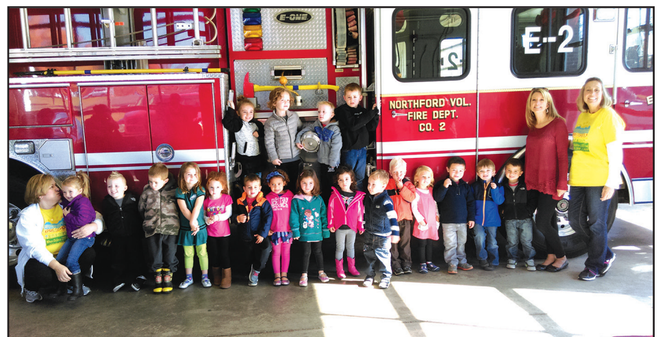
Northford Preschool Academy visits Company 2 to learn about Fire Safety.