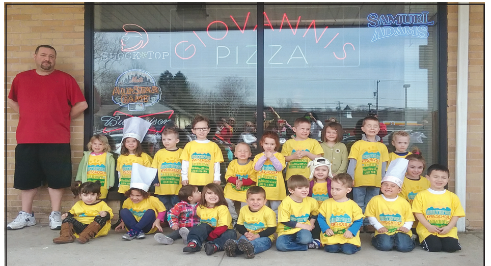
Northford Preschool Academy visited Giovanni's Pizza to learn how to make pizza, as part of their restaurant theme.