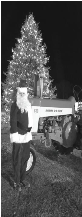
Cosponsored by the North Branford Rotary

Look for our 'Gifting Trees' at the Atwater Library, Smith Library and STW Community Center in Early December!